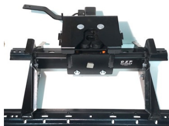
Universal Crossbed Rails 20K & 25K Rating