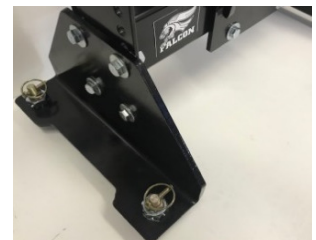
Factory OEM 20K Rating